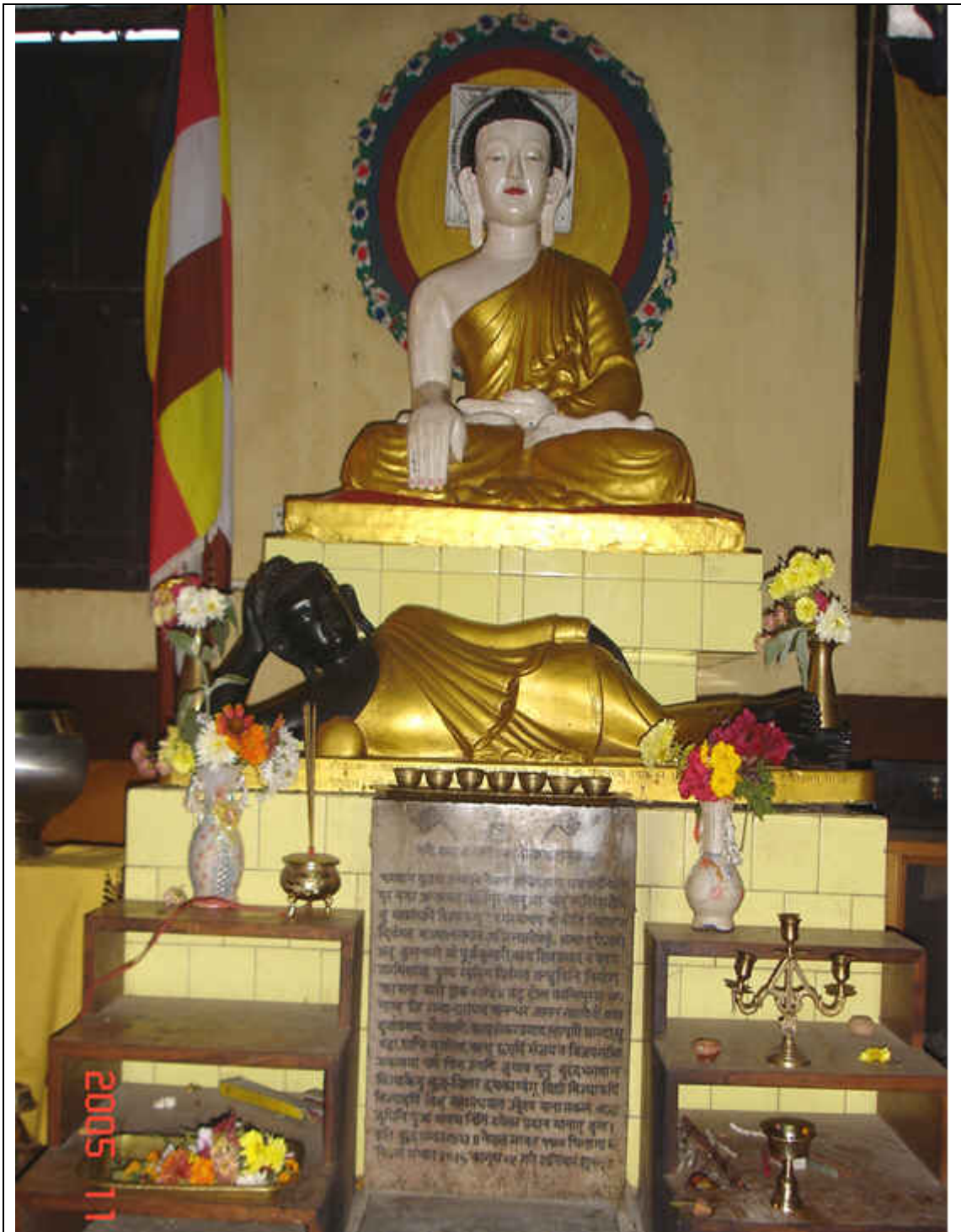
Main Buddha Image at Sri Kirti Vihara