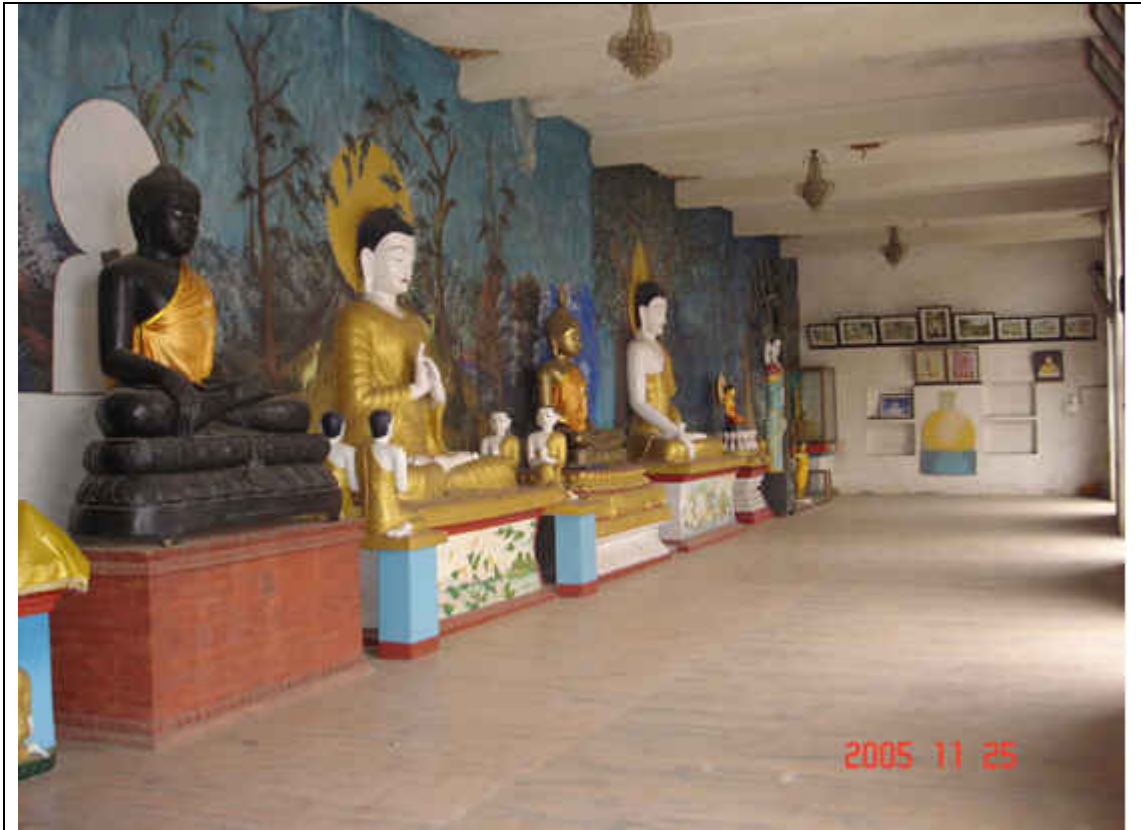
Four holy places