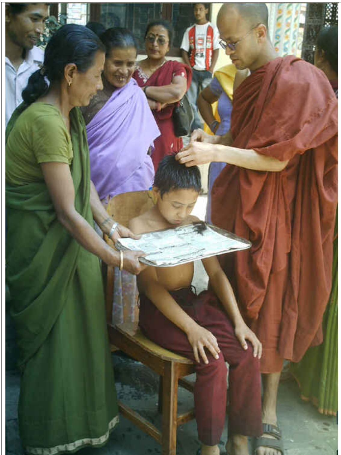
Ordination Ceremony at Vishwa Shanti Vihara