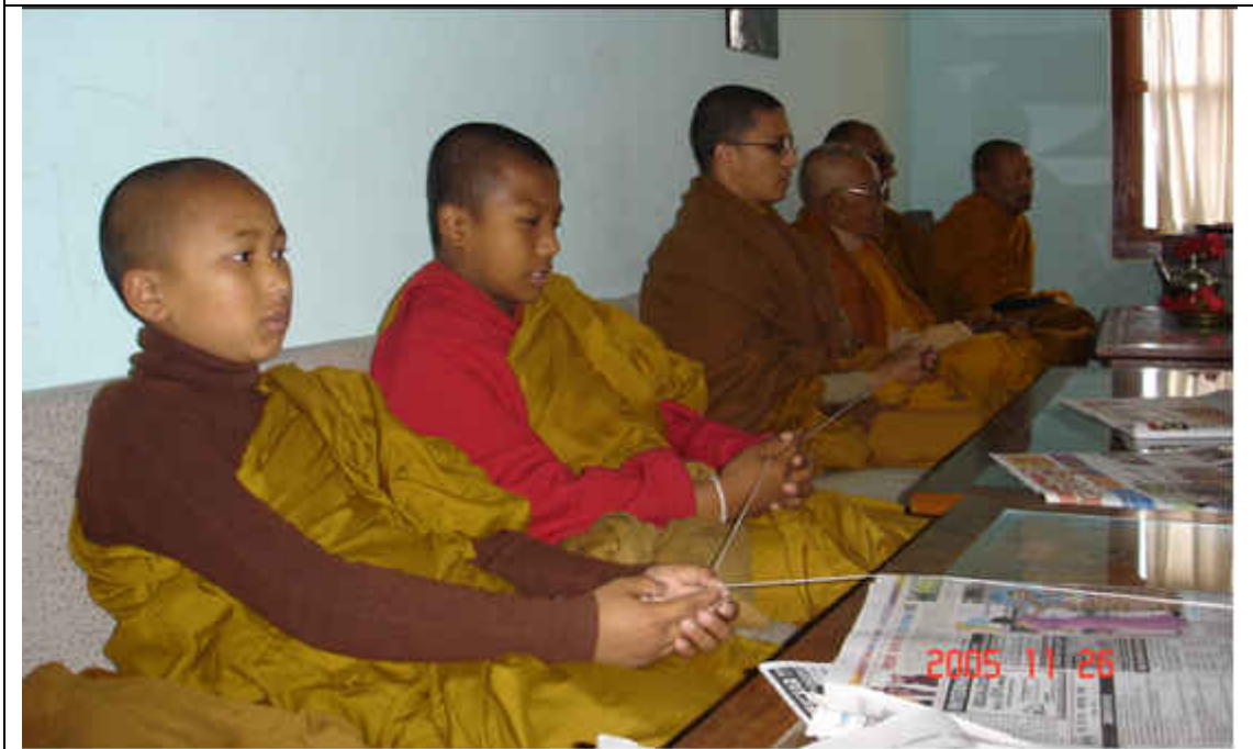
Chanting Paritta in devotee's home