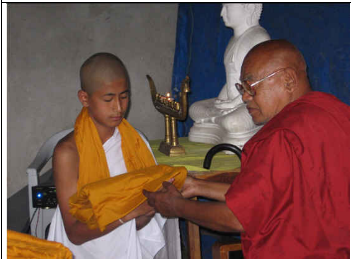
Samanera ordination at Muni Vihara