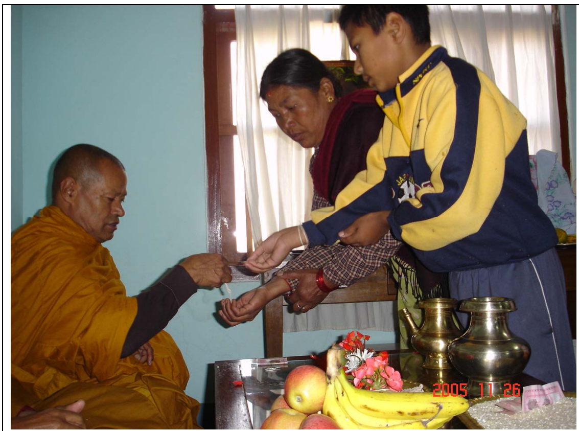
Giving Holy Thread to Devotees